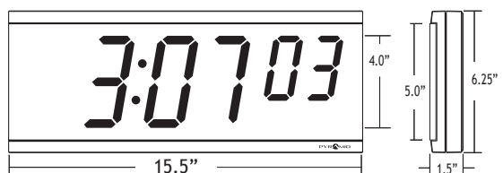
4" x 6 Digit Series