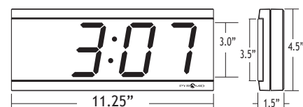
3" x 4 Digit Series