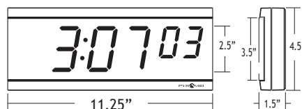
2.5" x 6 Digit Series